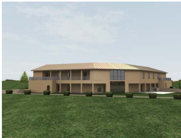
Computer generated image of completed clinic.